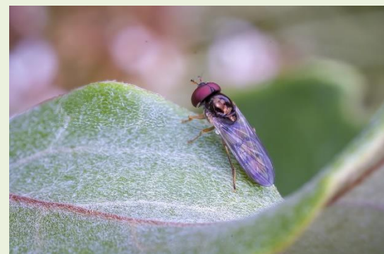
Adult hoverfly, a beneficial species.

The second outbreak was also successfully controlled, through the timely intervention of predatory insects.