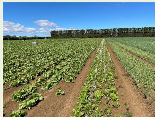
Our thriving lettuce crop, flanked by annual plantings, and strategically placed insectaries within the crop.

Despite these pressures, the IPM system proved effective, operating with success. However, the occurrence of aphid infestations despite the implementation of advanced management techniques, raises important questions.