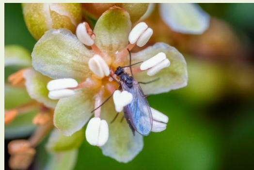
The biodiverse planting on the farm has provided food and shelter for a wide range of insects.

The diversity of plantings within our farm ecosystem played a significant role in pest management.