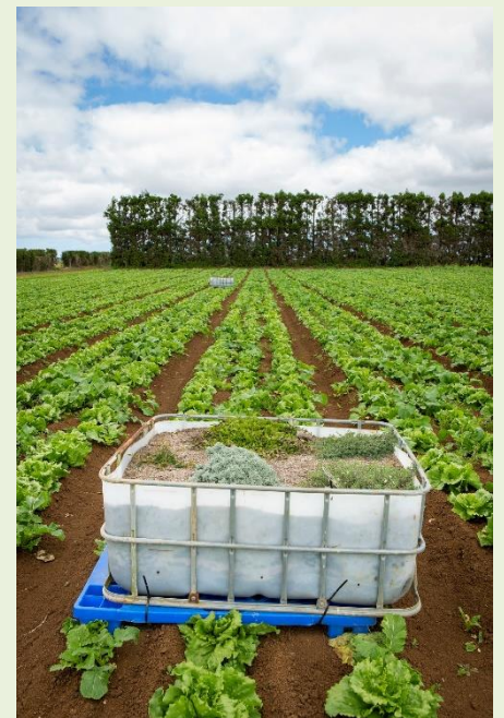
An insectary of native plants in the lettuce crop was another component of the biodiverse planting at the farm.

These developments underscore the dual impact of increased biodiversity: it introduces new challenges while bolstering pest control mechanisms.