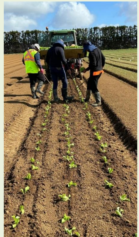
The dedicated lettuce planting crew in action, essential to the successful cultivation of our crops.

During this growing season, the crop benefitted from a diverse array of beneficial insects, crucial for natural pest control.