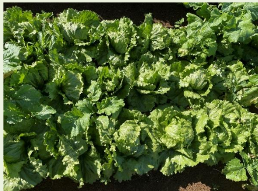
Lettuce thriving under careful cultivation and effective pest management practices.