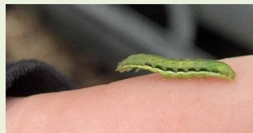
Native caterpillar spotted among the lettuce, highlighting the diverse insect life influenced by our farm's ecosystem

This approach led to a significant reduction, using eight fewer insecticidal active ingredients across five field spray applications.