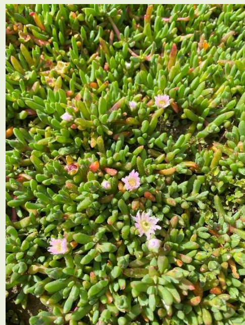
Native groundcover Disphyma austral .

The insectaries had the following flowering natives present: Leptinella dioica , Leptinella 'Seal Island', Leptinella rotundata , Manuka (flat, Joy Nursery), Leptospermum nanum 'Kiwi', Leptospermum scoparium 'Kea', Muehlenbeckia axillaris , Parahebe catarractae 'Snowcap', Pimelea prostrata 'Anatoki', Pimelea prostrata (Joy Nursery), Pimelea prostrata (Robinson's Nursery), Pimelea prostrata 'Silver Ghost'.