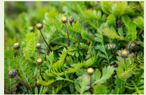
Leptinella dioica in flower.

The table below outlines the schedule of fungicide and insecticide applications made during the crop cycle, comparing our biodiverse crop with a similar conventional crop nearby. This comparison illustrates our reduced reliance on chemical treatments due to our integrated pest management and biodiversity strategies.