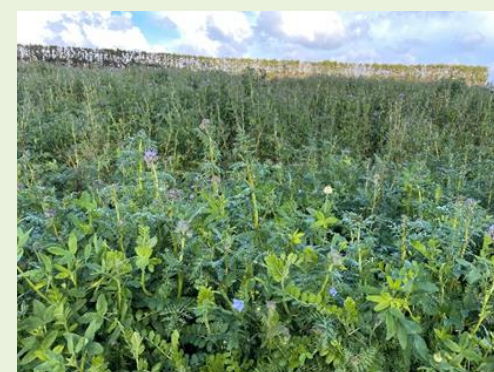
Cover crops provided habitat for natural enemies alongside native plants in bloom during the September lettuce.