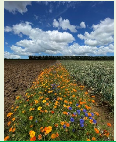
Above: Five species annual flower mix (4 January 2024)

Keep detailed records of sowing dates, species used, germination success, and flowering periods. Use this data to refine your approach each year, adjusting sowing dates and species mixes based on performance and environmental conditions. This practice of continuous improvement will help optimize the benefits of annual flower strips in supporting your farm's ecosystem. To effectively track your progress, consider using a spreadsheet. You can find an example tracking spreadsheet on the biodiversity project page.