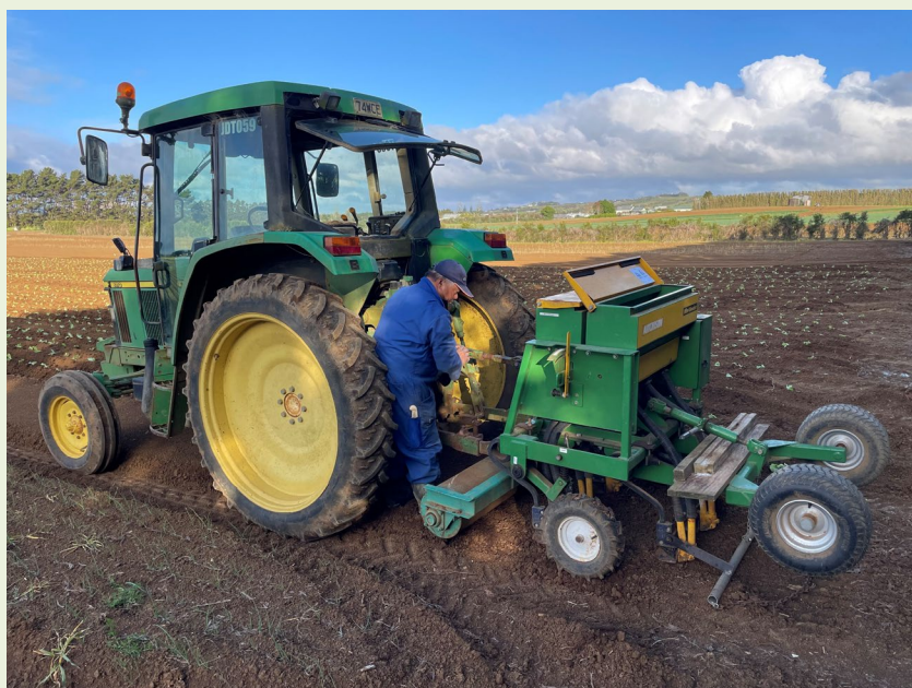
Preparing the planter for sowing the annual flower rows.

Educate your farm staff about the benefits of the floral strips and actively involve them from the beginning. It is crucial that everyone involved understands the location and importance of these floral areas to prevent accidental damage during routine operations. Clearly mark these areas and provide regular updates and training sessions to help staff adjust to these new elements on the farm. Be prepared for some initial hiccups as everyone learns to integrate these practices effectively.