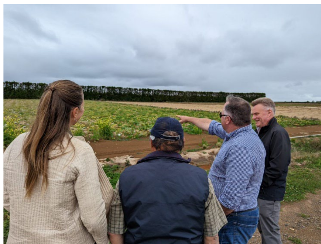
PGG learning about the various projects on the Pukekohe Demonstration Farm.